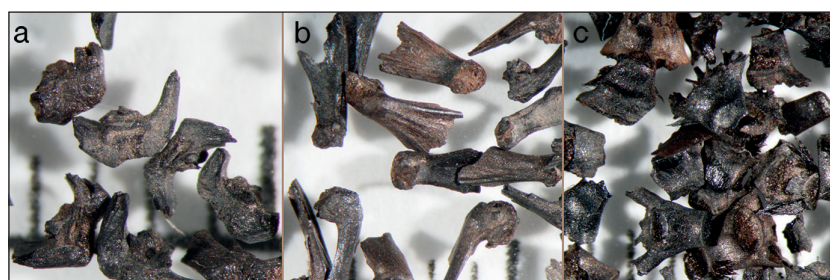
Fig. 4. Most frequent macroremains from the loom-weight cereal by-products. a emmer spikelet forks; b glume bases; c barley rachis fragments.

Although in both cases of sampling, the researched material was waterlogged and clayey, the state of