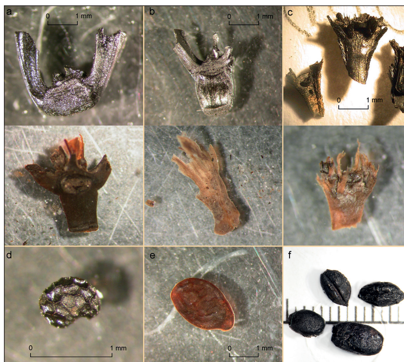
Fig. 3. The most important cultivar macroremains from the Stare gmajne site, surface sampling: a emmer spikelet fork carbonised and uncarbonised; b einkorn spikelet fork carbonised and uncarbonised glume base; c barley rachis fragments carbonised and uncarbonised; d uncarbonised poppy seed; e uncarbonised flax seed; f carbonised barley grains (photos a-e T. Tolar, f D. Valoh).

An experiment was conducted to learn why different processes occurred when the plant remains were deposited in the loom-weight, i.e. mostly carbonised in waterlogged clayey material. Dry plant material (hay) was added to the clay from which two objects shaped similarly to the Stare gmajne loom-weight were made. As well as tempering, it became clear that the added plant material allowed very fine and easier moulding and forming of the raw clay. Two objects were made, each of them burnt (baked) on an open fire with hot coals for different times. The added plant remains in the object